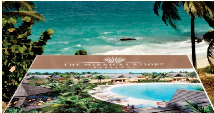
ABOVE RIGHT View overlooking the ocean from The Merricks Resort