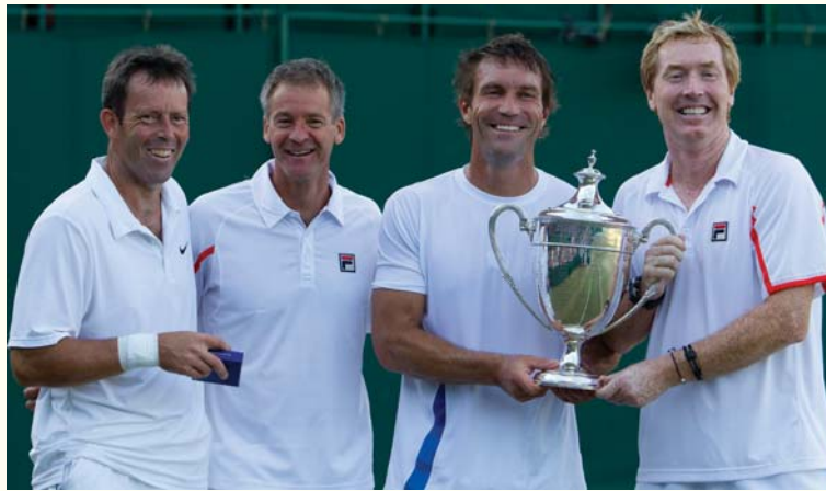
FAR LEFT Gentlemen's Senior Invitation doubles winners Pat Cash & Mark Woodforde