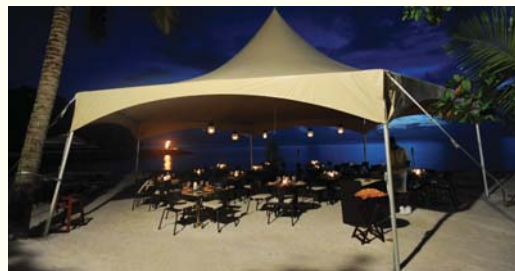
Bay View Restaurant