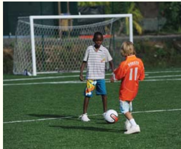
Lesson at Liverpool Football Club Soccer School on the new artificial pitch

"Whatever you want the staff will get it for you"