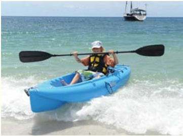
Guest Kayaking at Buccament Bay Resort