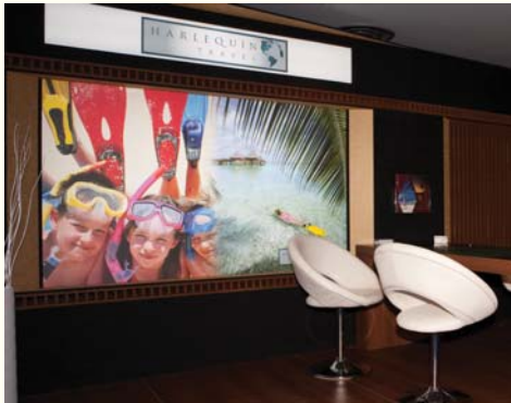
Harlequin Travel stand