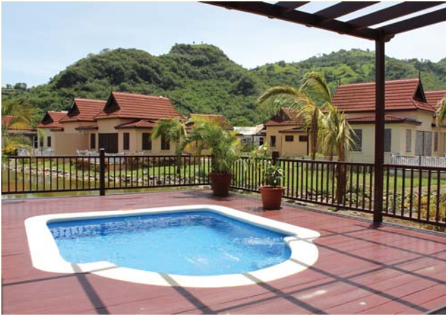
Buccament Bay Resort

& The Grenadines as a whole. The workers on the building site have been delivering high quality finishing. St Vincent & The Grenadines is one of the safest destinations for tourists, anywhere in the world. It is also the natural place to be. Our people are truly hospitable and we are grateful for the investment by the Harlequin group and their associates. By June 2012, an international airport of the finest standard will be opened for air traffic to and from St Vincent & The Grenadines. Before then, there is good air access through our other airports. My