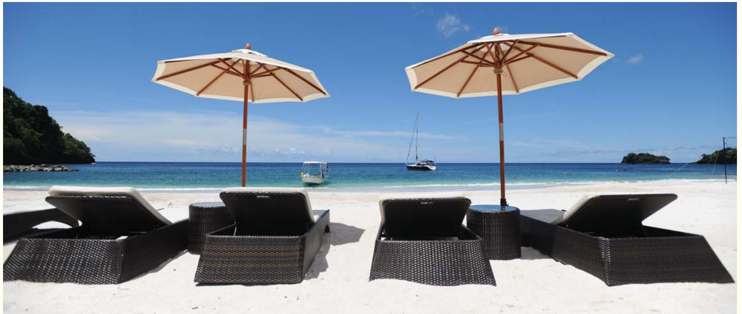
View from the beach