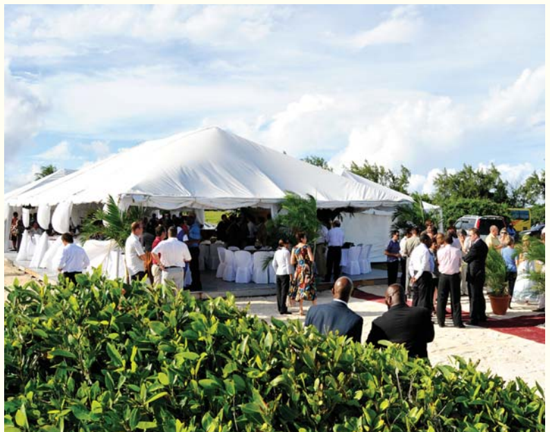
Guests arriving at the Groundbreaking ceremony