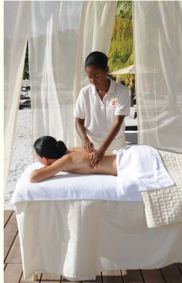
Massage gazebo on the beach