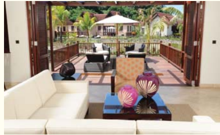
View from villa overlooking the landscaped gardens & pond