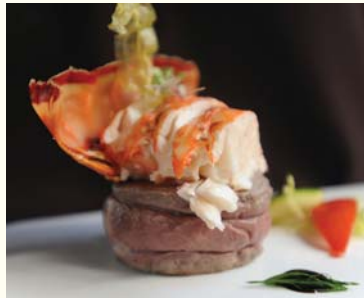
Cuisine from Buccament Bay Resorts Restaurants