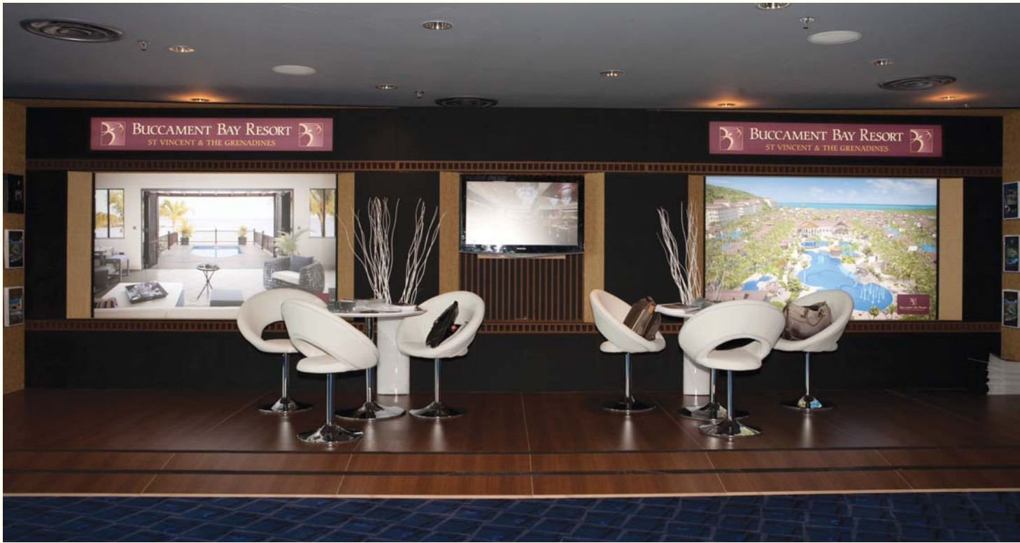
Buccament Bay Resort stand