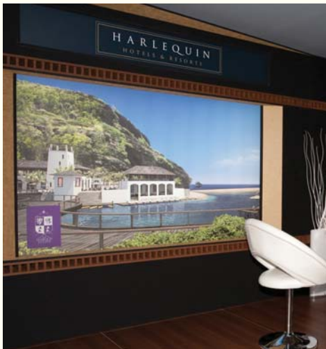
Harlequin Hotels & Resorts stand