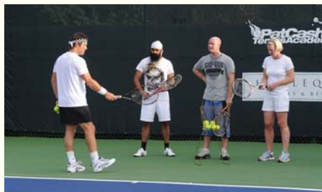
Pat Cash coaching guests at the Pat Cash Tennis Academy