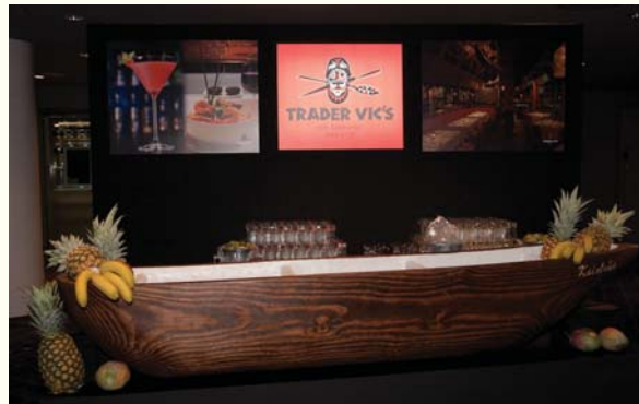
Trader Vic's stand

Pat Cash was unable to attend due to coaching commitments in Australia, so he recorded a video at Centre Court at Wimbledon, during which he talked about the Pat Cash Tennis Academies being created at each of Harlequin's Caribbean resorts and the Pat Cash Tennis Hotels which will be built at Las Canas, The Marquis Estate and Buccament Bay.