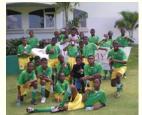
School children in SVG kit join in the celebrations

The programme "Caribbean Kop" was aired on Liverpool TV on Saturday August 7th you can now view it via the Harlequin Property website www.harlequinproperty.co.uk .