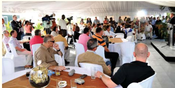
Guests listening to the speeches