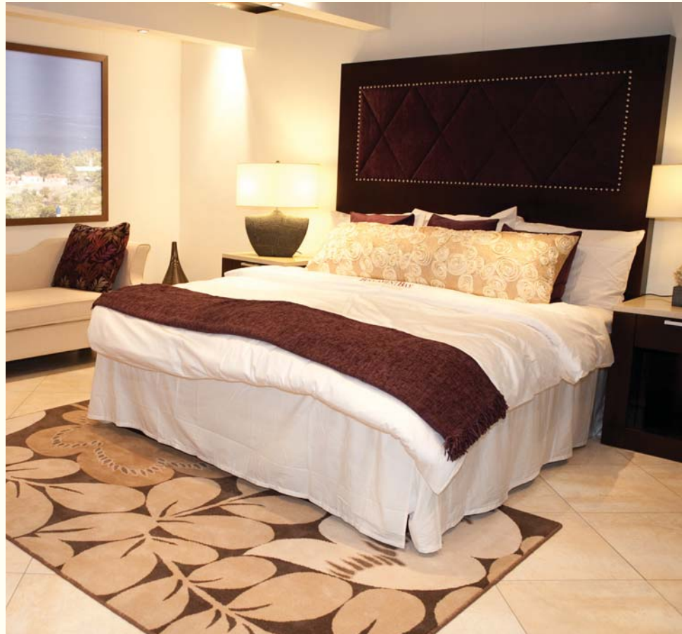
Interior of a villa bedroom