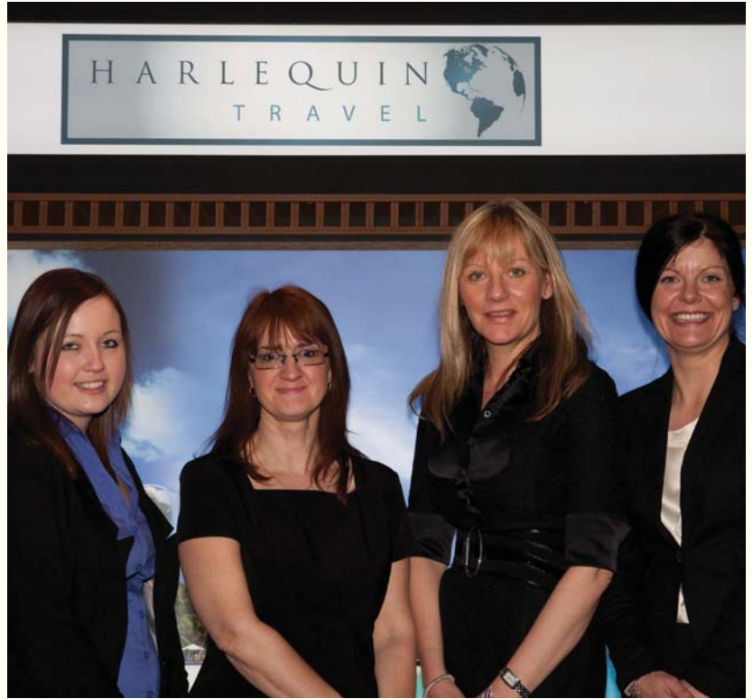
Harlequin travel team