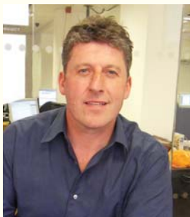
Harlequin's Ambassador, Sports & Radio Broadcaster and ex-footballer Andy Townsend

ABOVE The Bobby Moore room was the perfect setting for the launch event