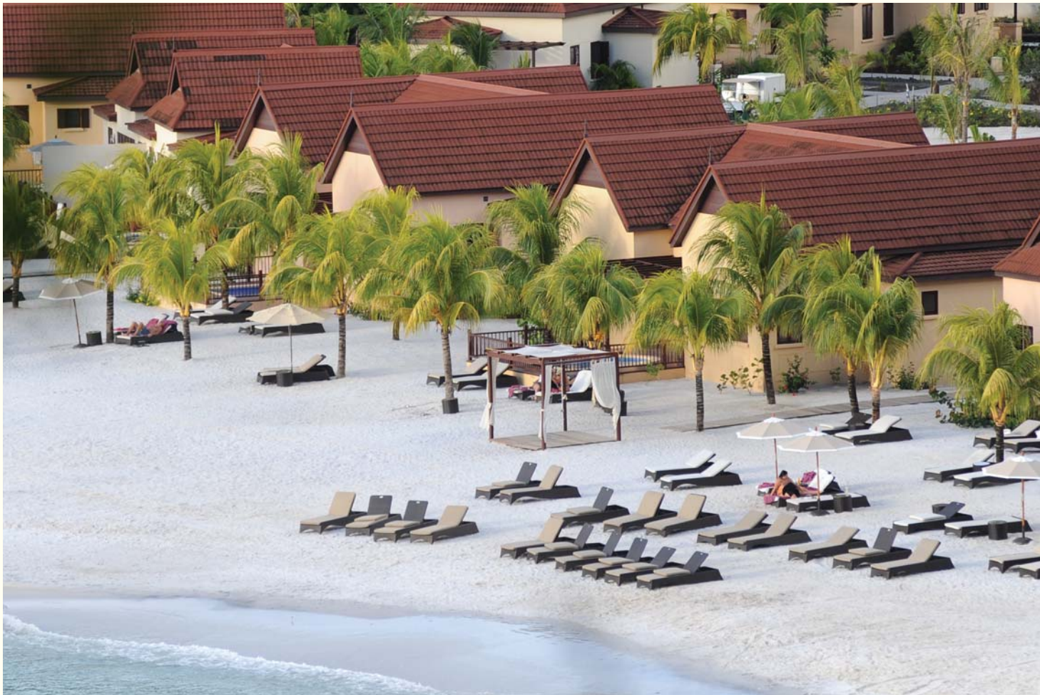
Buccament Bay Resort beach front

"The resort is surrounded by lush greenery and is in a beautiful location"