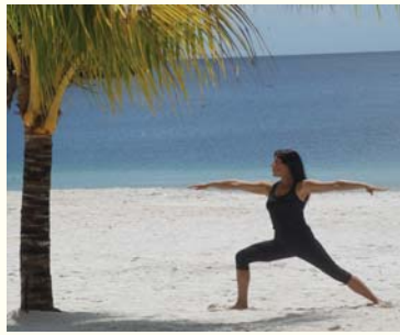
Yoga on the beach