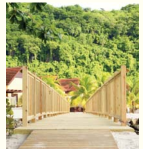
Bridge to Buccament Bay Resort

Construction is still ongoing and during the first weeks guest were very understanding of the finishing that was still underway in and around their accommodation. The resort is progressing daily with the planting and water features now reaching the final stages of completion.