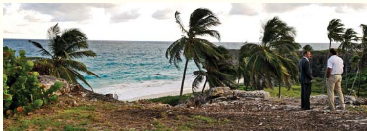
Overlooking the beach at The Merricks Resort

quality and style that Harlequin will be delivering at The Merricks Resort. The first phase of construction for the resort will start following completion of the planning condition response process. Adams Consulting International is currently working with Harlequin Developments to meet the points raised by the planners during this final stage and we hope to have these resolved during the next few weeks. The largest issue is the limited water supply in St Philip and Harlequin is working with the Government and local authorities to find a solution to increase the supply to not only support The Merricks Resort but also to improve the situation for the local people of St Philip.