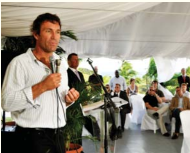
Pat Cash addressing guests at the ceremony