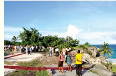
Guests looking at the view and the CGI's