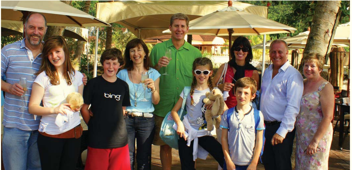
First guests arrive on the opening day of the resort, 13th August 2010